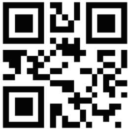
To receive text message alerts about FYM events please text FYMTEENS to 68398 or scan the QR code above.